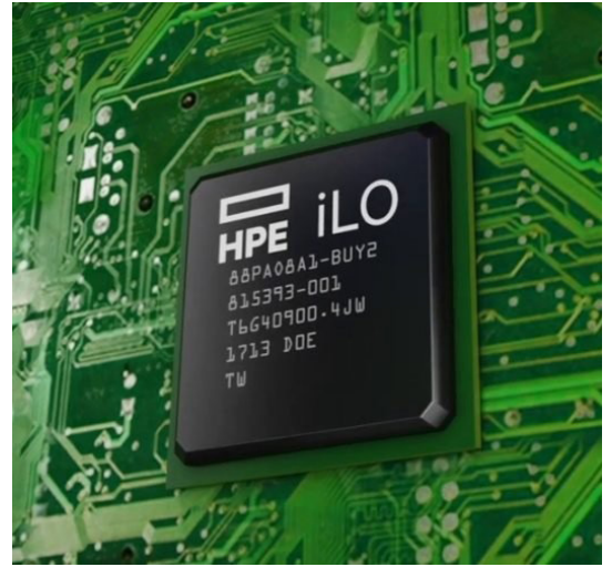
Figure 1. HPE iLO 7

HPE iLO multilayer silicon root of trust protects servers from manufacturing to end of life and provides compliance readiness for future quantum-computing attacks.