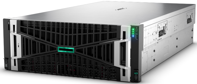
Figure 2. HPE ProLiant DL380a Gen12 server

Get the higher performance needed for new AI and edge workloads, and boost VDI efficiency—all while saving space and energy